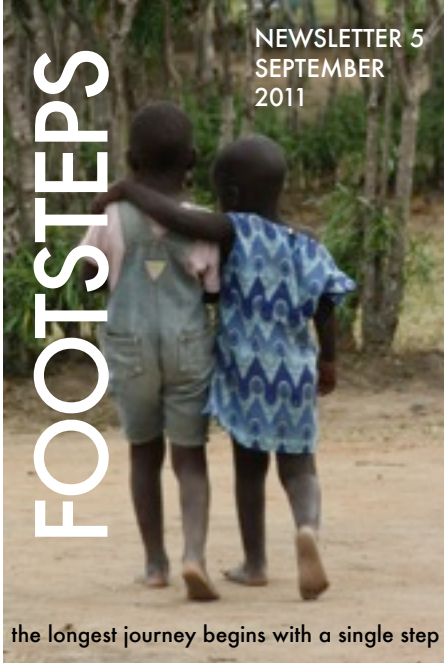
the longest journey begins with a single step